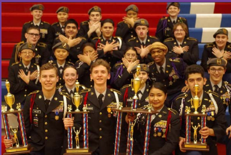
Central JROTC Places Third in the AL Annual Drill Meet!