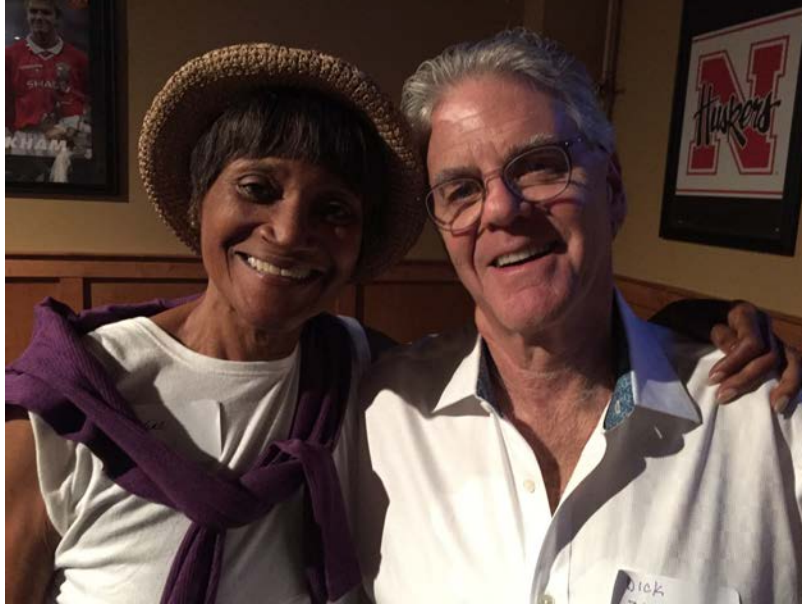
Old friends reunited at the CHS Class of 1961 class reunion!

The 2022 Reunion Season is upon us! Please look below for an update and a person of contact for your reunion. If you have any questions, please reach out to the Central High School Foundation.