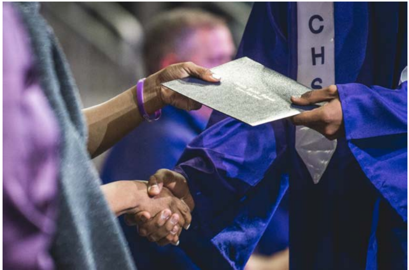
The Class of 2022 graduated on Tuesday, May 24, 2022 at 7pm at Baxter Arena. We are proud of the hard work of this resilient class, and welcome them to the larger Eagle Alumni Community!