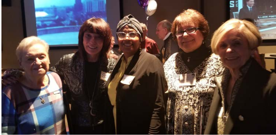
Old friends reunited at the CHS Class of 1961 class reunion!

The 2022 Reunion Season is upon us! Please look below for an update and a person of contact for your reunion. If you have any questions, please reach out to the Central High School Foundation.