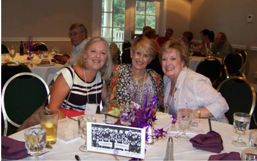
Class of 1964's Reunion (2014)

Many of our reunions have been postponed or cancelled for 2020. Please look below for an update and a person of contact for your reunion. If you have any questions, please reach out to the Central High School Foundation. In the meantime, please click here to watch one of our Affinity Reunions!