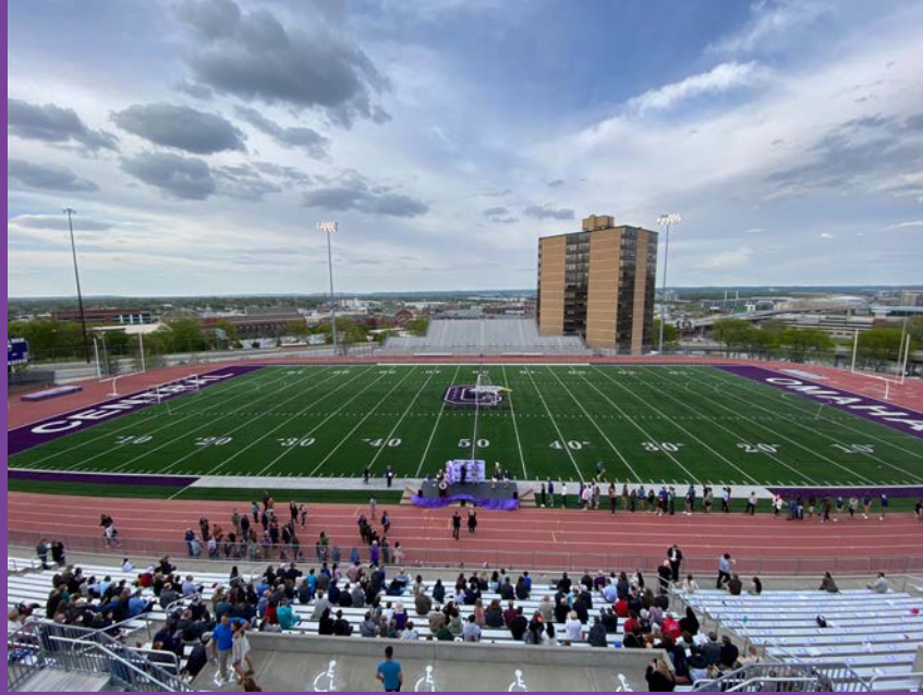
2021 Outdoor Senior Recognition Ceremony