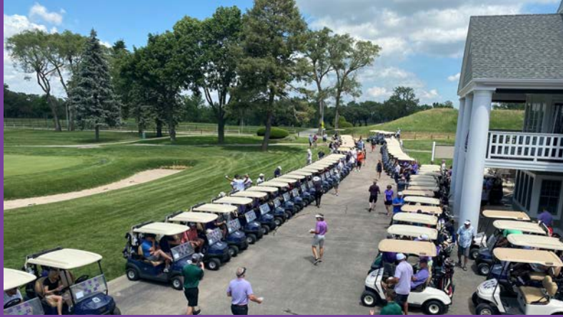
2021 Golf Fore Eagles!