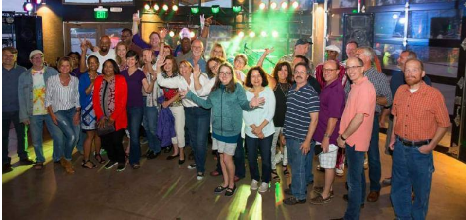
Class of 1976's 40th Reunion (2017)

Many of our reunions have been postponed or cancelled for 2020. Please look below for an update and a person of contact for your reunion. If you have any questions, please reach out to the Central High School Foundation. In the meantime, please join us for one of our upcoming Affinity Reunions!