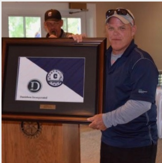
Banquet Sponsor Danielson Incorporated