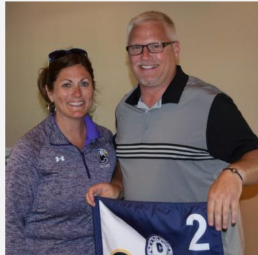
Eagle Nest Sponsor Prairie Mechanical Corporation