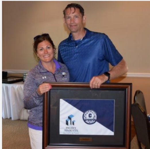
Title Sponsor Project Advocates

A big thank you to all of our sponsors for this year's event!