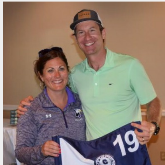
19th Hole Sponsor Triage Medical Staffing