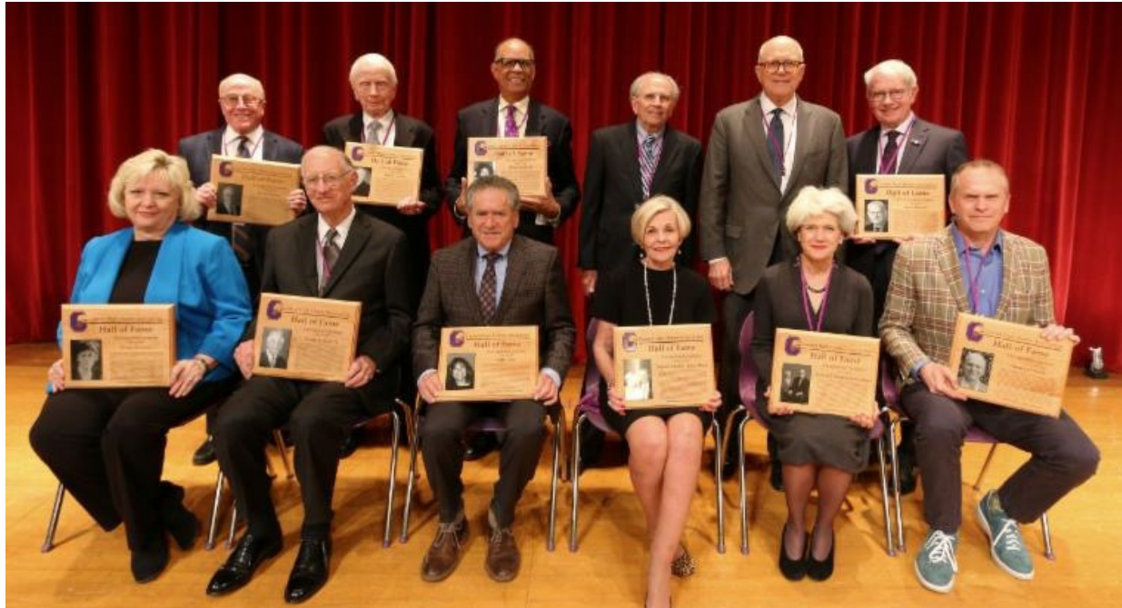
Congratulations to the Hall of Fame Class of 2018!