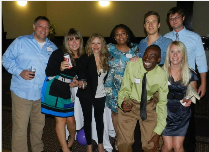
Class of 2002