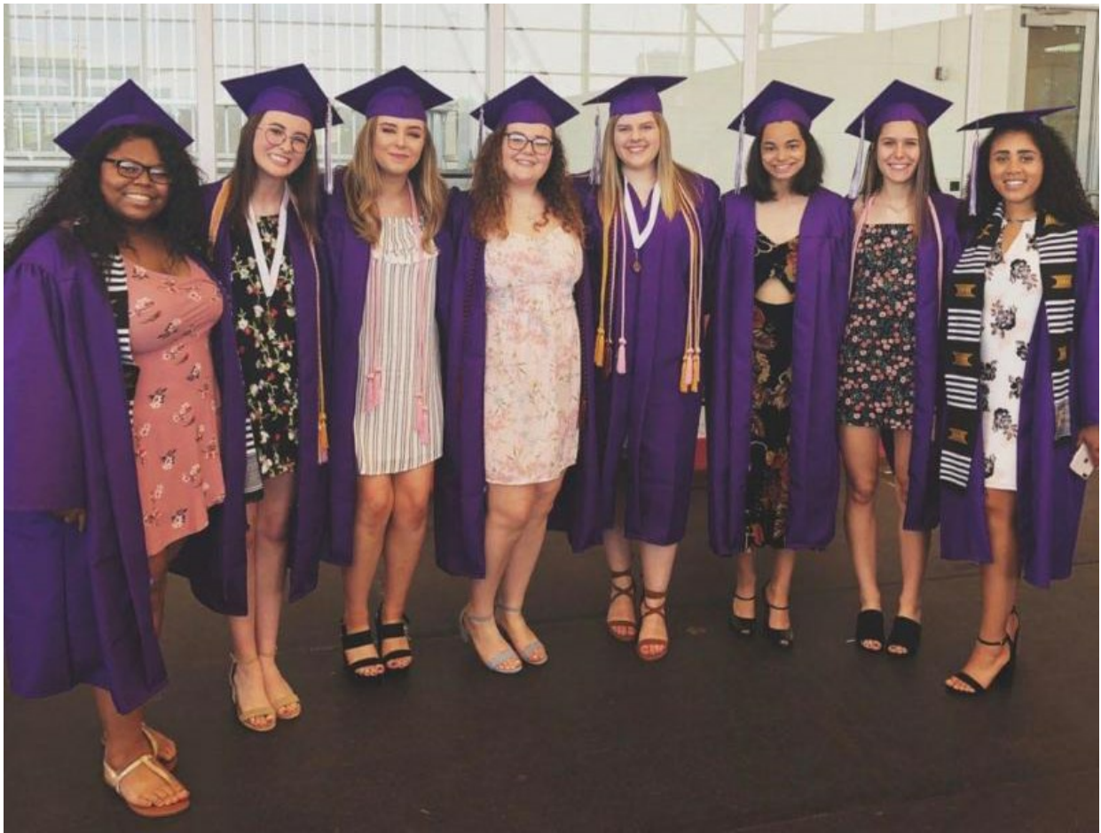
Class of 2018 Eagles pose for a picture before the graduation ceremony on May 27, 2018