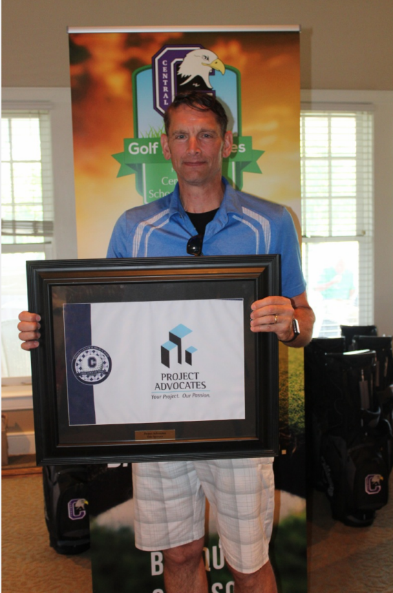
Project Advocates Title Sponsor