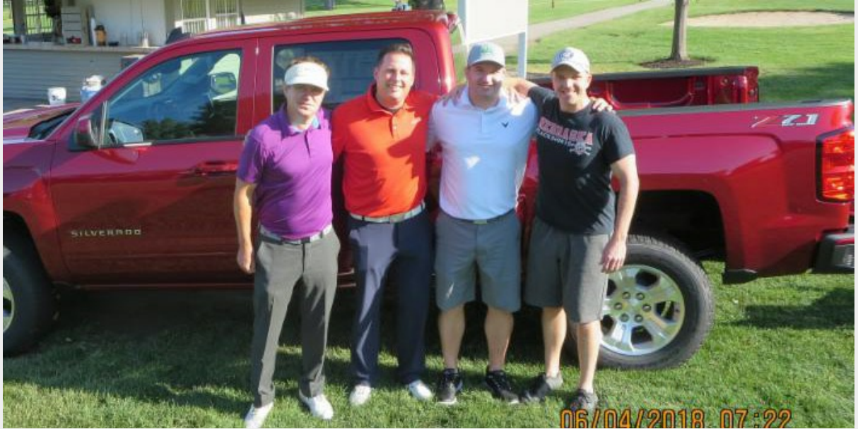
Golfers in the foursome who won First Place in the First Flight