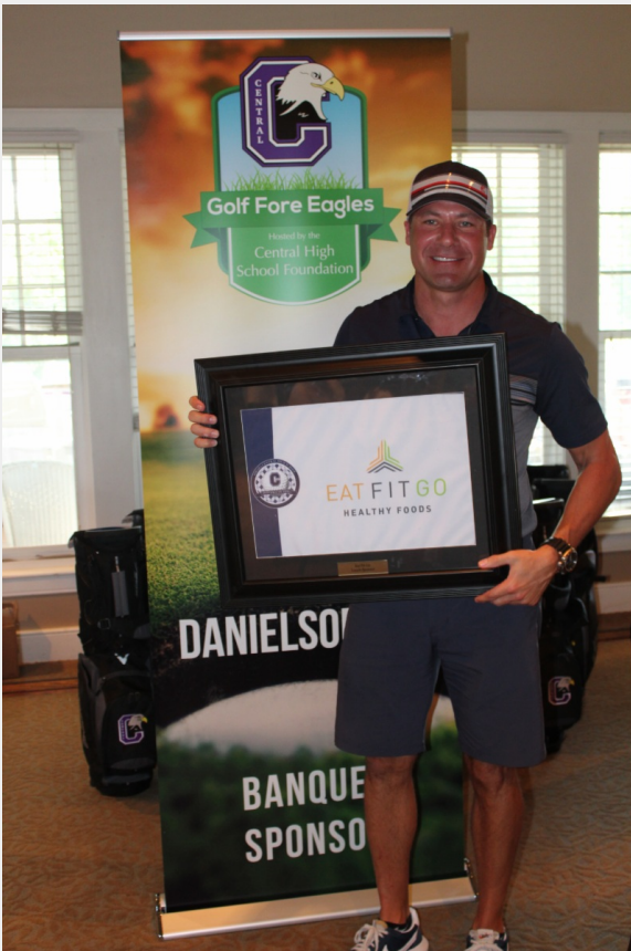
Eat Fit Go Lunch Sponsor