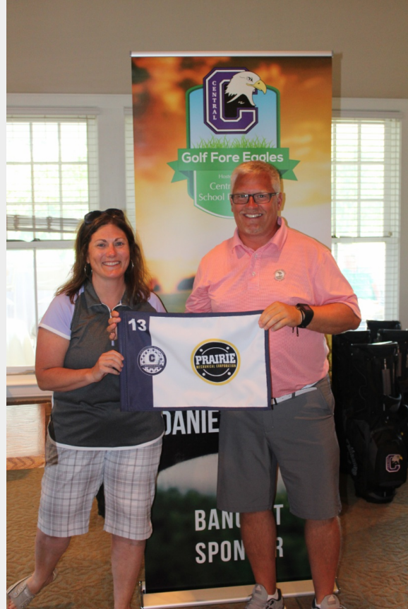
Prairie Mechanical Corporation Eagle Nest Sponsor