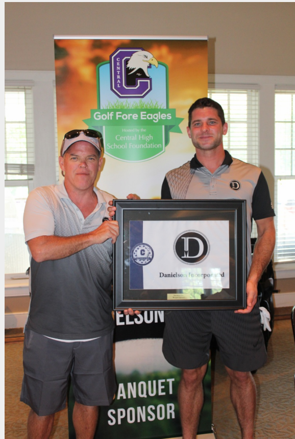
Danielson Inc. Banquet Sponsor