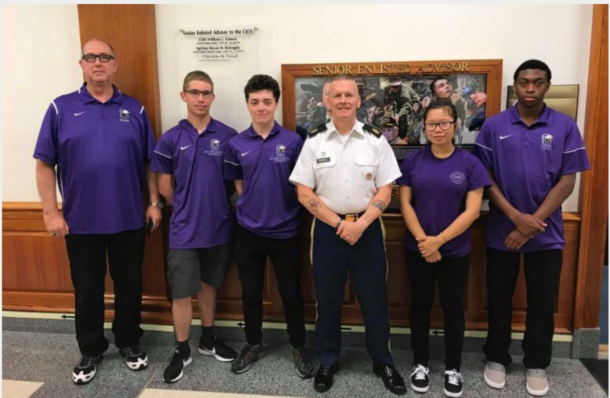
The Eagle Battalion JROTC Academic Team participated in the 2018 Army JROTC