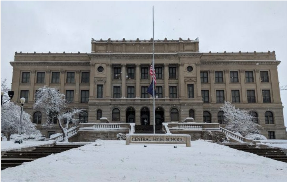
An early snowfall kicked off the month of December at Central

Having trouble viewing? Click here to view as Webpage