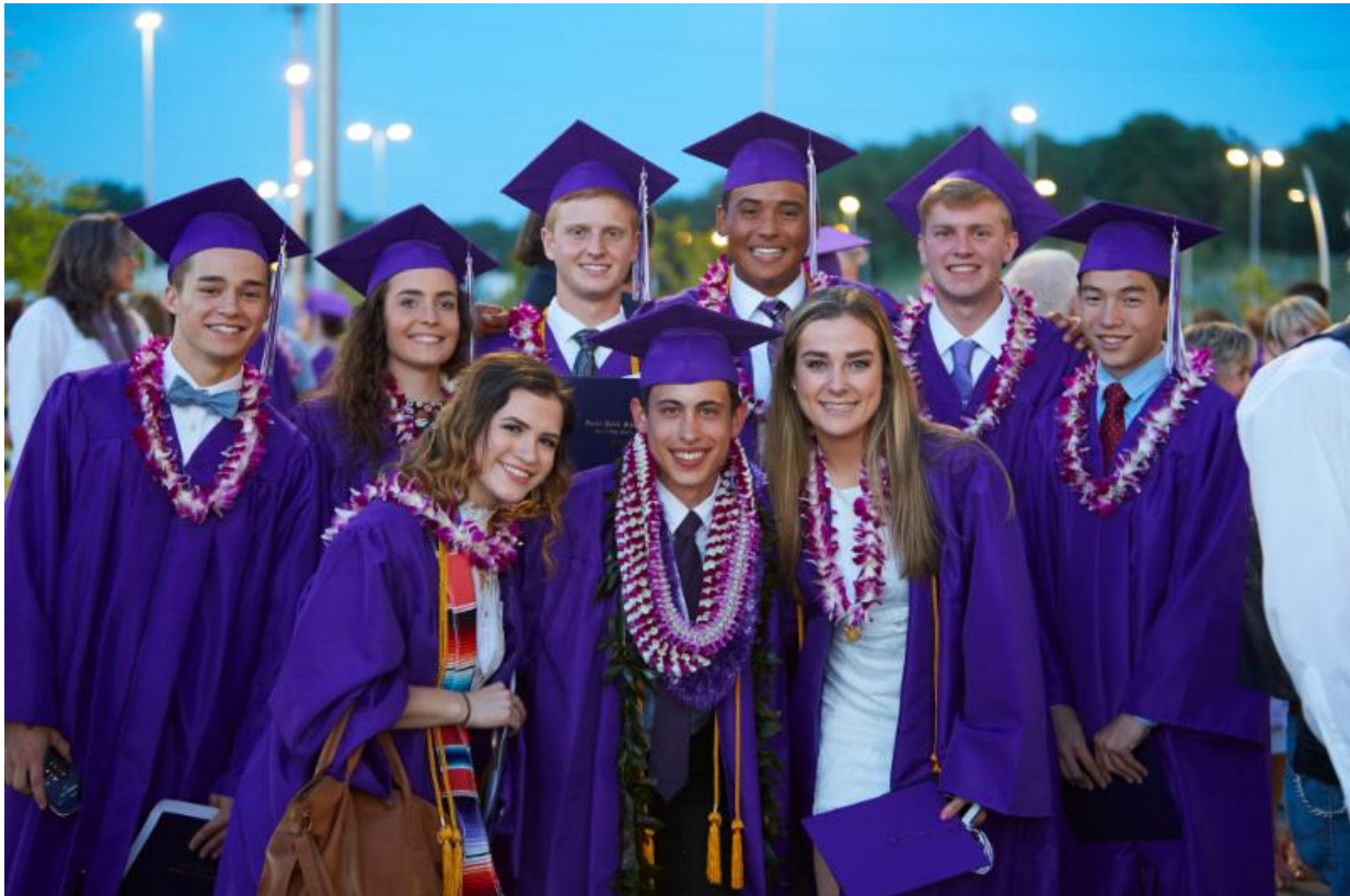
Students pose for a picture after receiving their diplomas.