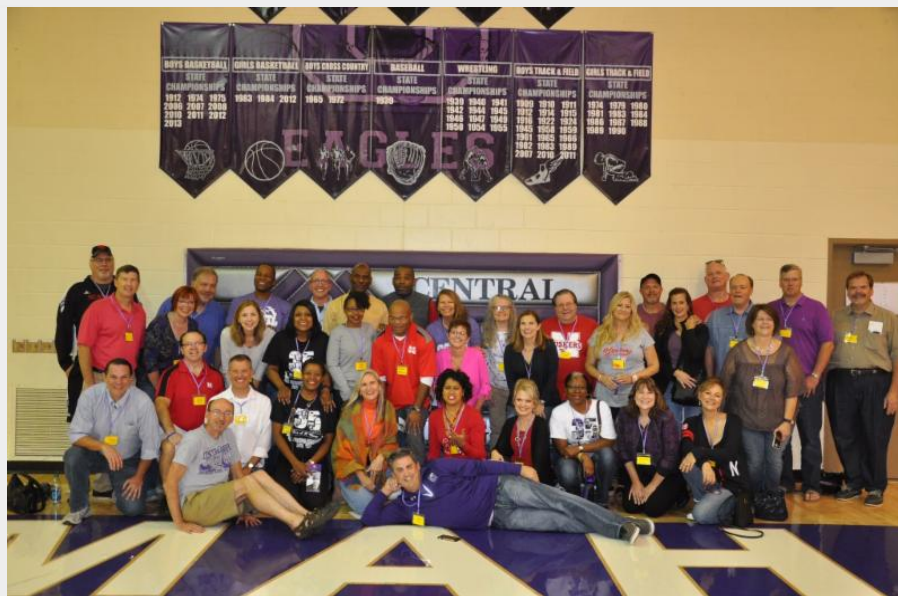
Class of 1981