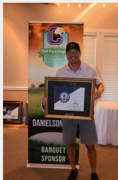
Eat Fit Go Lunch Sponsor