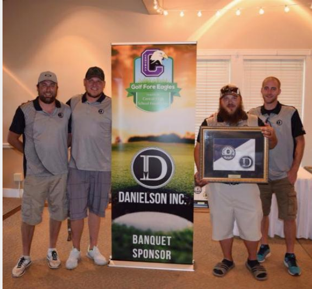
Danielson Inc. Banquet Sponsor