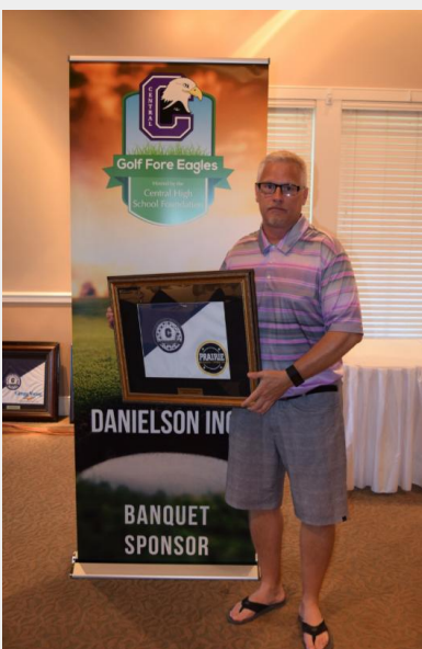
Prairie Mechanical Corp. Eagle Nest Sponsor