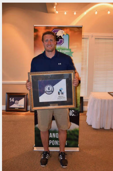
Project Advocates Title Sponsor

A big thank you to all of our sponsors for this year's event!