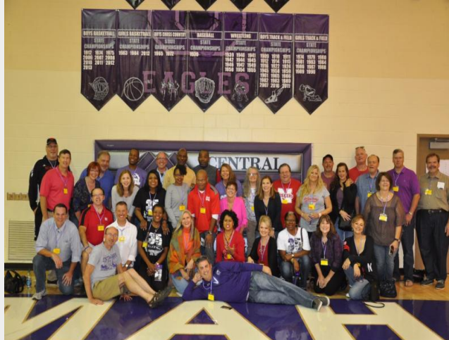
Class of 1981 Reunion