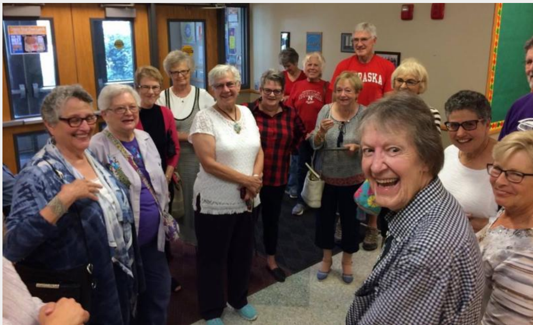
Class of 1961

2016 was a fantastic year for reunions, and the classes of 1961, 1966, 1976, 1981, 1986, 1991, 1996, and 2006 really impressed us with their dedication and motivation to aid Central High School with their donations to the First Class Challenge.