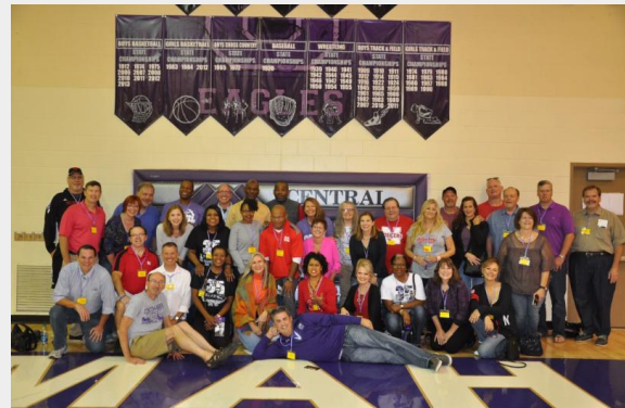
Class of 1981 Reunion