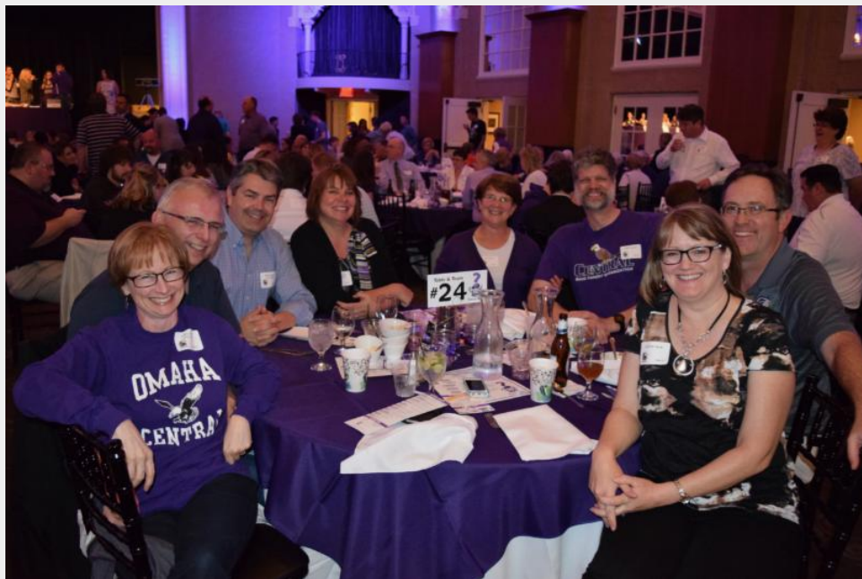
2016 Rock the Nest Trivia Night

Registration is now open for the 2017 Rock the Nest "Trivia Night." Mark your calendar to attend this fun interactive event on Sunday, March 26, 2017, at the Scouler Ballroom.