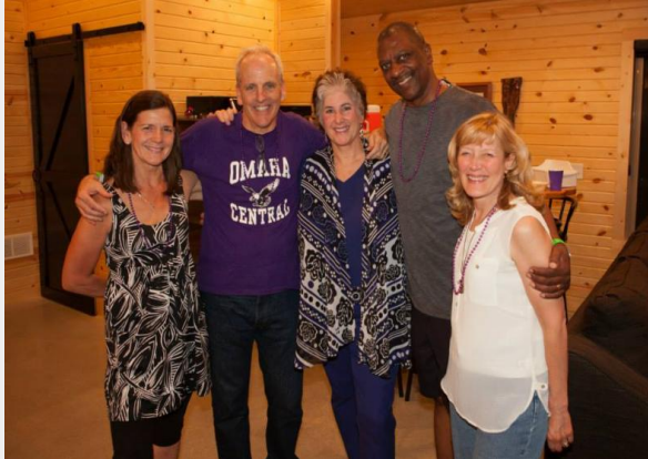
Class of 1974 Reunion