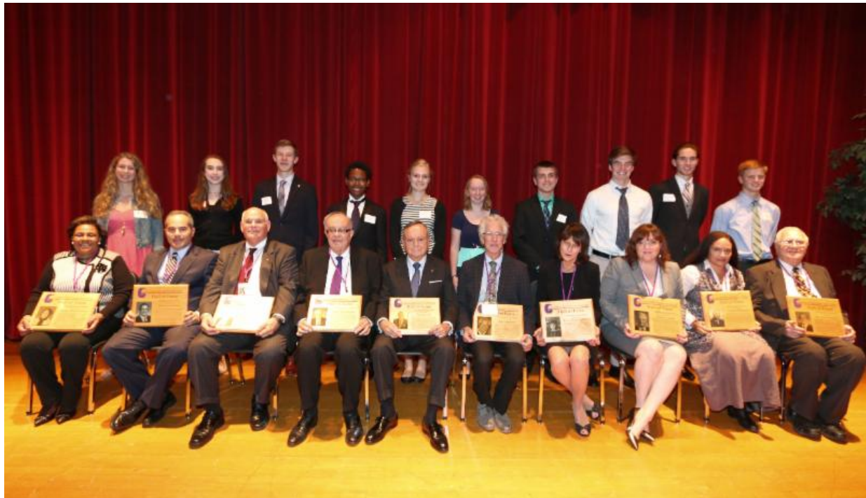
The 2016 Hall of Fame class poses for pictures at the ceremony on October 6, 2016.