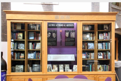
The display of published alumni in the Central High School courtyard.

If you are an author or musician with published works, let us know! We have a wonderful library with the work of CHS alumni. We invite you to donate two copies of your work to the CHS Foundation office. One copy will be proudly displayed in the Central High School courtyard in a display case with other Alumni authors, and the other will