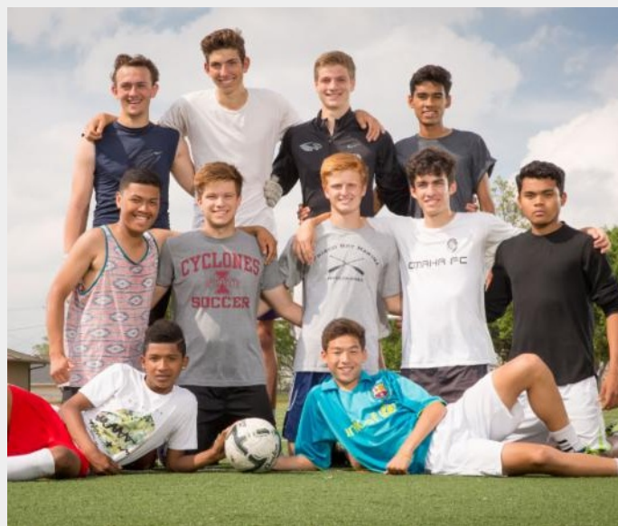
Boy's Soccer Team Starting Lineup

Central High School Boys Soccer team is back in the State Soccer Tournament. Central was last in the Boys State Soccer Tournament back in 1997. Central takes on Creighton Prep tomorrow, Thursday, May 11, 2016, at 1 PM CST at Morrison Stadium on the campus of Creighton University. Cost to enter is $5 for students and $7 for adults. Central won the Boys State Soccer Championship in 1992.