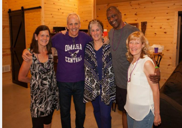
Class of 1974 Reunion