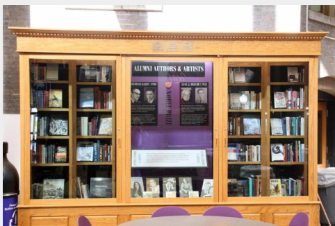
The display of published alumni in the Central High School courtyard.

If you are an author or musician with published works, let us know! We have a wonderful library with the work of CHS alumni. We invite you to donate two copies of your work to the CHS Foundation office. One copy will be proudly displayed in the Central High School courtyard in a display case with other Alumni authors, and the other will