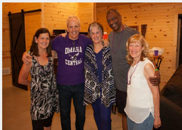
Class of 1974 Reunion