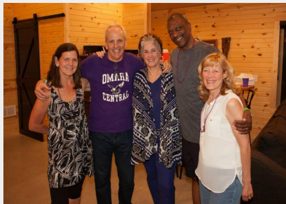
Class of 1974 Reunion