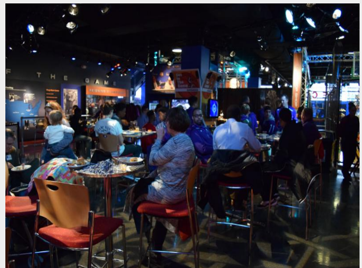
Basketball players mingle with alumni at the KC luncheon.

The Eagles migrated south to Kansas City to take on Hogan Prep on Monday evening for the Martin Luther King Memorial Classic. The Central High School Foundation hosted an alumni luncheon at the NCAA Basketball Hall of Fame prior to the game at the Sprint Center for Eagle alumni in the Kansas City area. Following the luncheon, the Rams, ranked number three in Missouri, offered a challenging matchup with the Eagles. Many CHS alumni attended the game and cheered on the Eagles until the