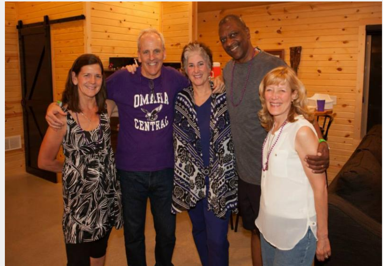
Class of 1974 Reunion