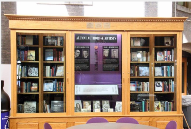
The display of published alumni in the Central High School courtyard.

If you are an author or musician with published works, let us know! We have a wonderful library with the work of CHS alumni. We invite you to donate two copies of your work to the CHS Foundation office. One copy will be proudly displayed in the Central High School courtyard in a display case with other Alumni authors, and the other will be available in the library to inspire future authors. To view a complete list of works currently in the collection, please click here .