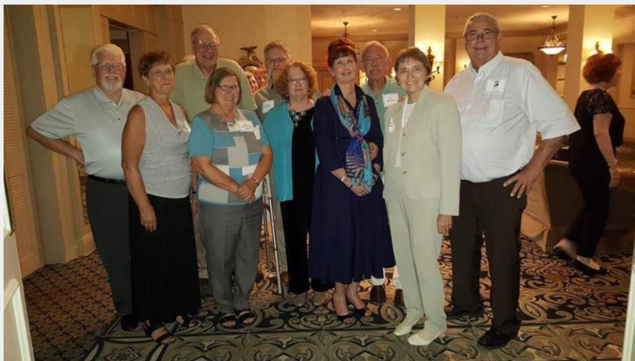
Members of the Class of 1965

2015 was a fantastic year for reunions, and the classes of 1947, 1955, 1960, 1965, 1975, 1980, 1985, 1990, 1995 and 2005 really impressed us with their dedication and motivation to aid Central High School with their donations to the First Class Challenge.