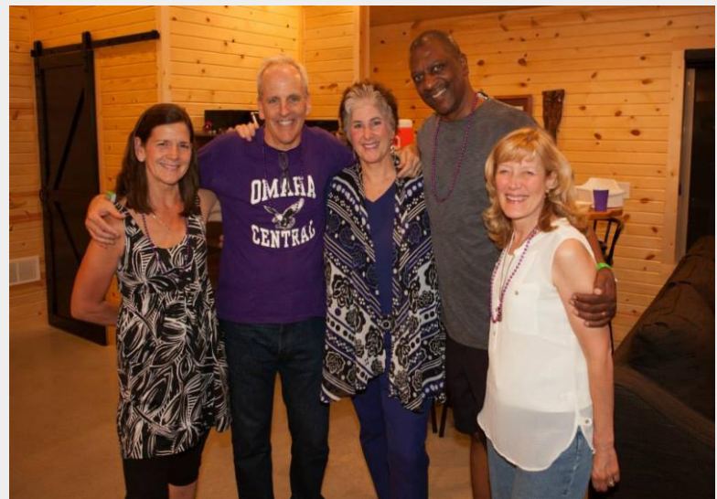
Class of 1974 Reunion