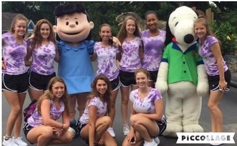
The Dance Team recently took a trip to Worlds of Fun in Kansas City.