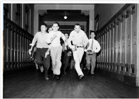
"Many Paths, One Spirit" All Class Reunion for Classes 1959 and Prior May 1st - 2nd

We are prepping for our class reunions this year! Please make sure you stay updated by visiting our reunion page on our website!