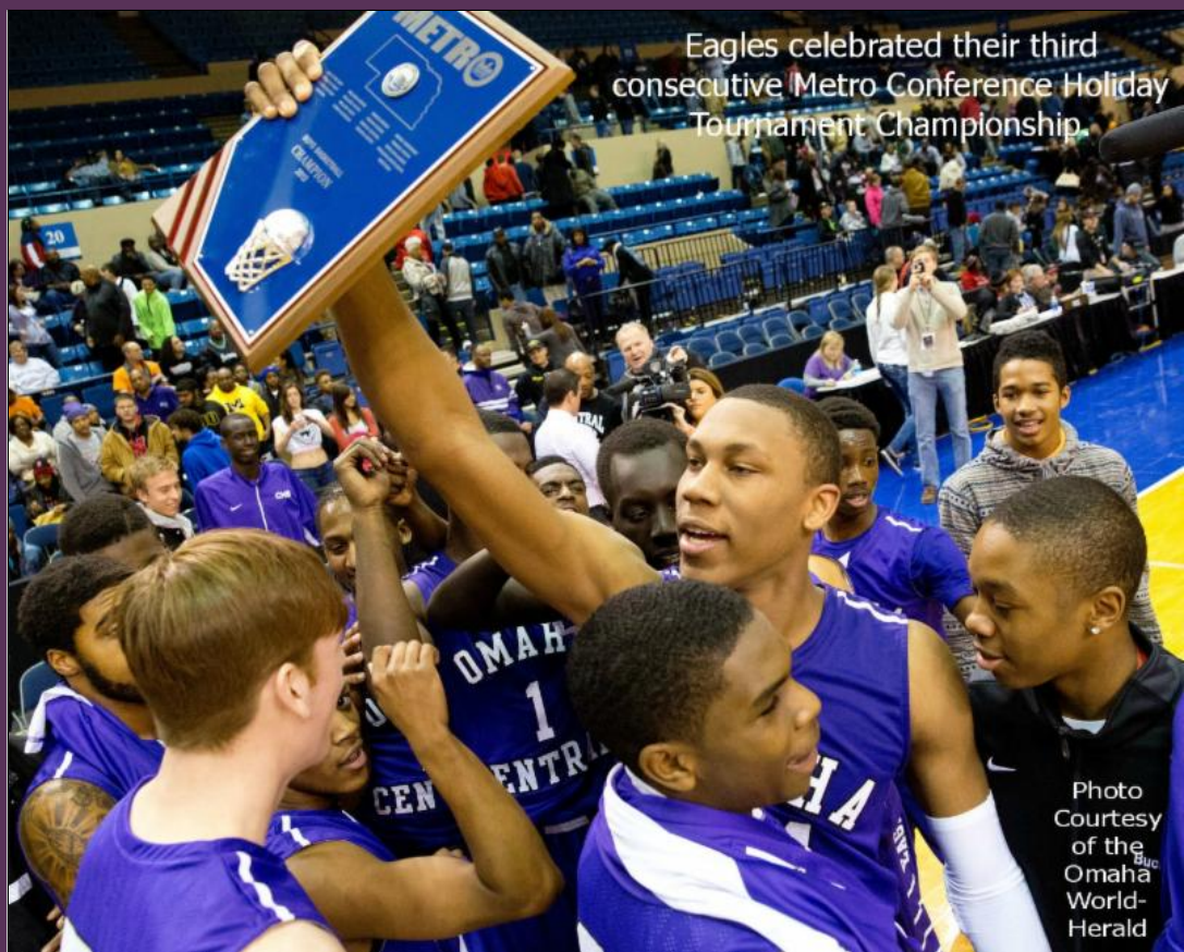
Eagles celebrated their third consecutive Metro Conference Holiday Tournament Championship.