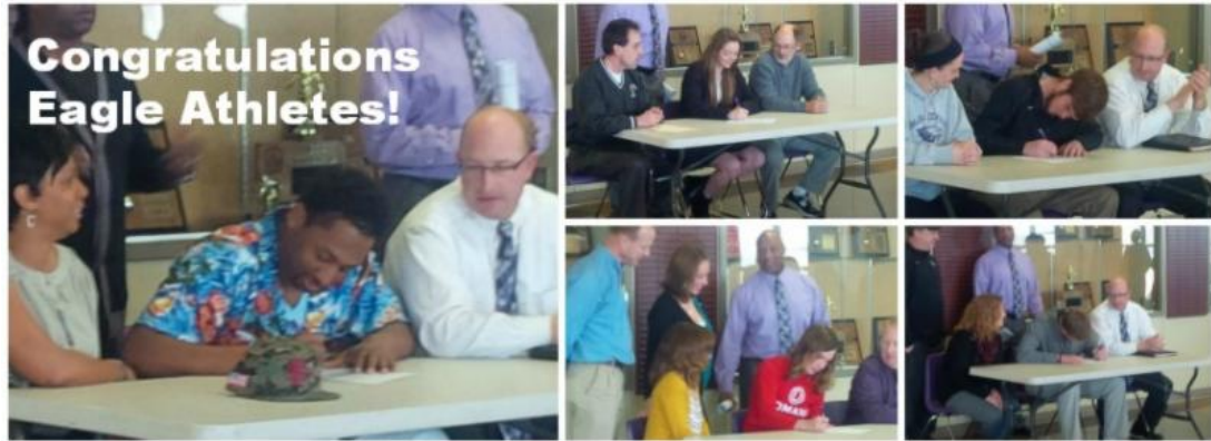
Congratulations to our Eagle Athletes who committed to colleges and universities across the nation at the 2014 Spring Signing Day.