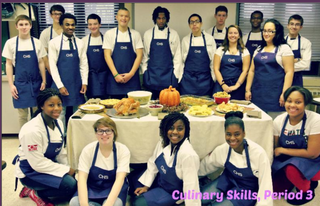
Culinary Skills, Period 3