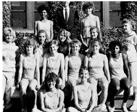
1987 CHS Girls Track Team.

The CHS girls track teams of 1974 to 1990 will receive this year's Dominant Dynasties Award at the 2013 Induction and Awards Ceremony presented by the Nebraska High School Sports Hall of Fame Foundation. Members of those teams, along with the 2013 Hall of Fame inductees and other honorees, will be recognized at a ceremony to be held on Sunday, September 15, 2013, at the Lied Center in Lincoln, Nebraska. If you are a member of one of these outstanding track teams,