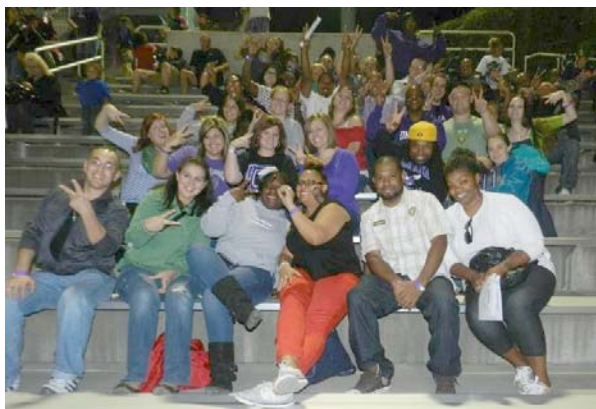
CHS Class of 2002 at their 10th reunion last summer.

It's that time of year again! Are you ready to come back to the Nest? Be sure to check out our 2013 Reunion Schedule for this summer.