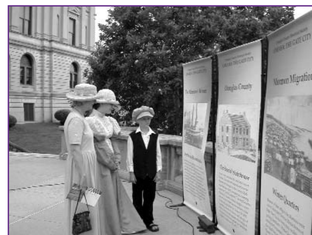
Douglas County Historical Society volunteers in period dress read banners outlining Omaha's early history.

Central was selected as the venue for the announcement to commemorate Omaha's first picnic, which was held July 4, 1854 on Capital Hill (the site of CHS), to celebrate the founding of the new city.