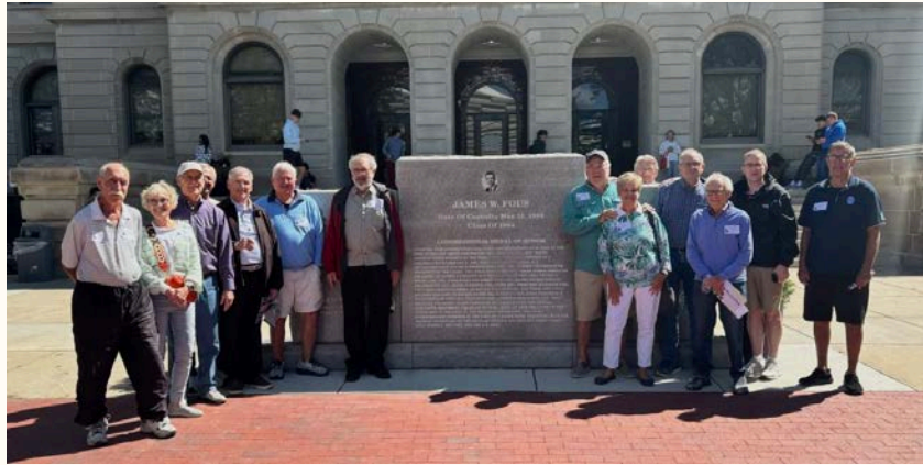
The class of 1965 at their reunion in 2025!