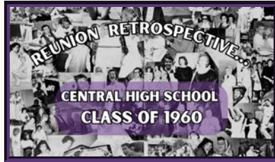
Reunion Retrospective - 1960