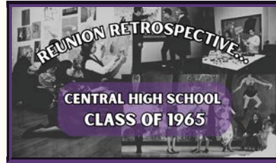
Reunion Retrospective - 1965