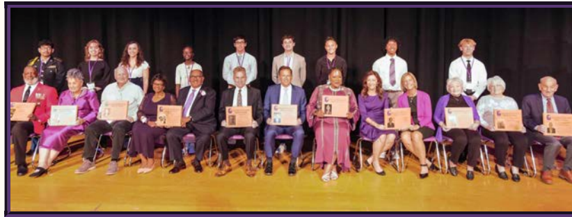
Pictured: 2025 Central High School Hall of Fame inductees

We are pleased to announce the Central High School Hall of Fame Class of 2026! These inductees have exemplified the Eagle spirit of excellence in their respective communities, in their professional endeavors, and in their ceaseless efforts to give back to others. The 2026 Hall of Fame ceremony will be held on Thursday, October 8, 2026, at Central High School.