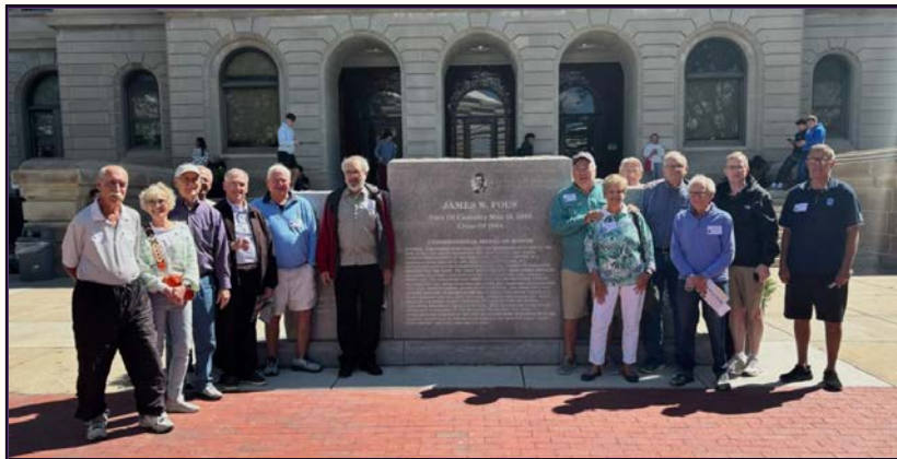
The class of 1965 at their reunion in 2025!