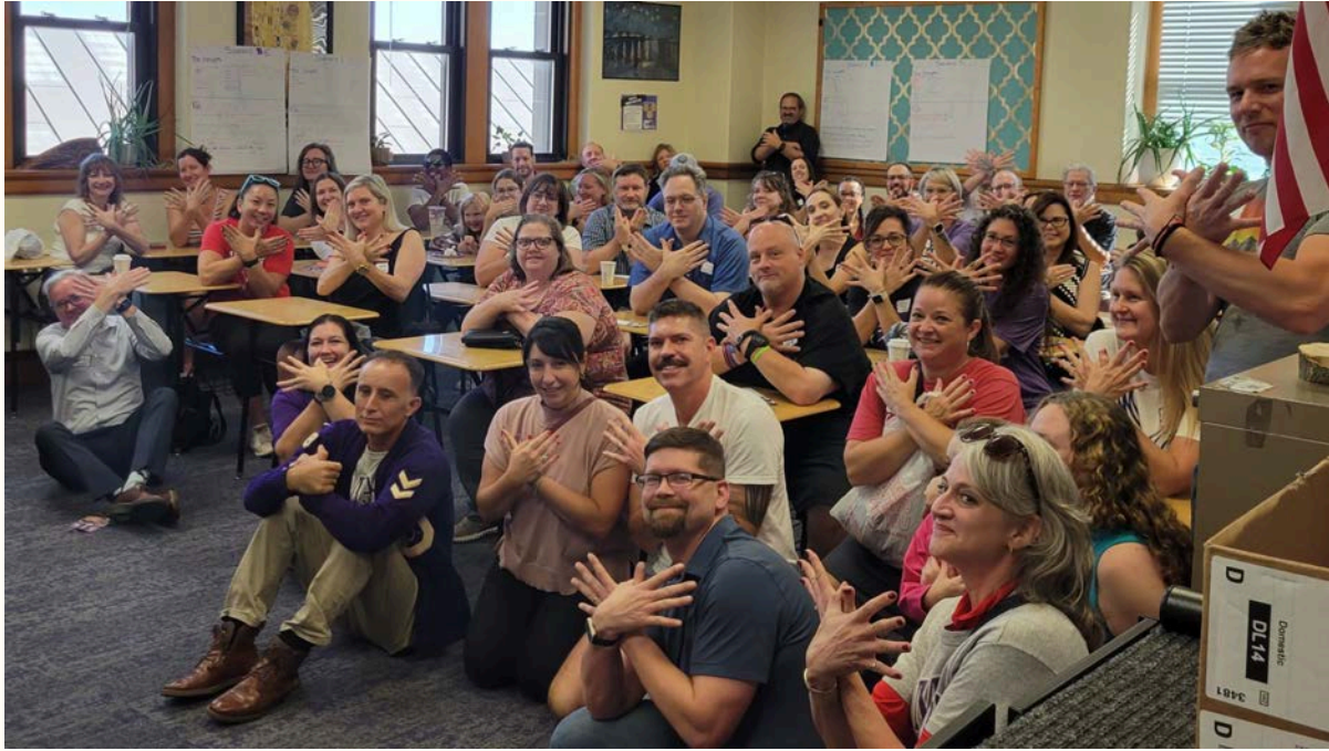
The class of 1995 at their reunion this year!