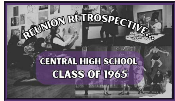
Reunion Retrospective - 1965