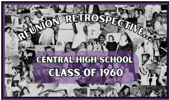
Reunion Retrospective - 1960