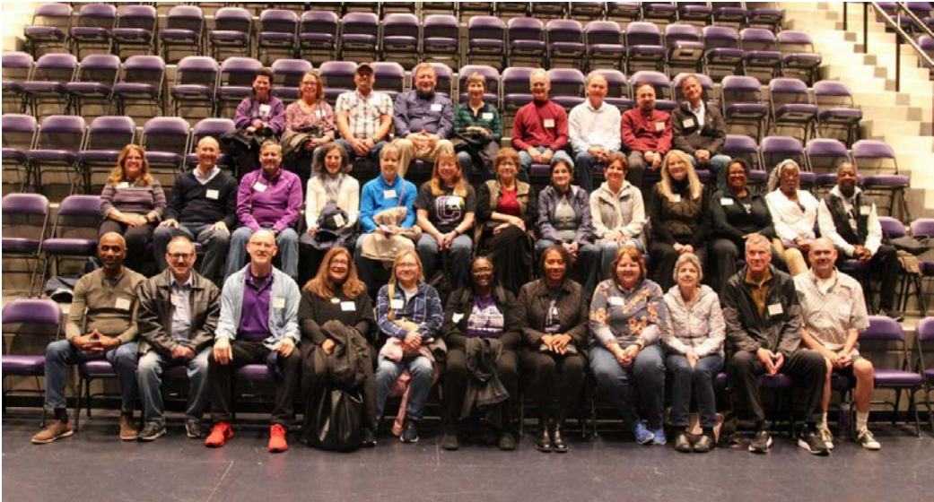
The class of 1979 at their reunion in 2024!