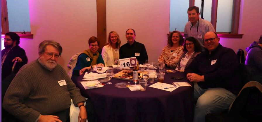
Our 1st Place Trivia Winners, The 1859ers!

Alumni, students, teachers, and parents rocked the nest at the 15th annual Rock the Nest Trivia Night late last month. On a new night and at a new venue, Rock the Nest raised over $35,000 for Central High School.