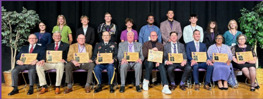
Pictured: 2024 Central High School Hall of Fame inductees

It is our pleasure to announce the incoming Class of 2025 of the Central High School Hall of Fame! These inductees have exemplified the Eagle spirit of excellence in their respective communities, in their professional endeavors, and in their ceaseless efforts to give back to others. The 2025 Hall of Fame ceremony will be held on Thursday, October 9, 2025, at Central High School.