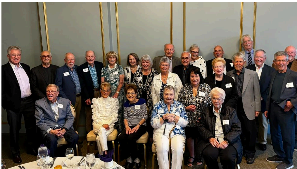
The class of 1959 at their reunion in 2024!