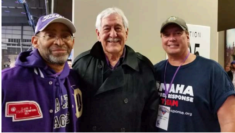
Class of 1976 at their reunion in 2021!