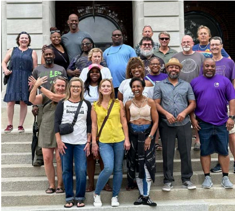
Class of 1989 at their reunion in September!