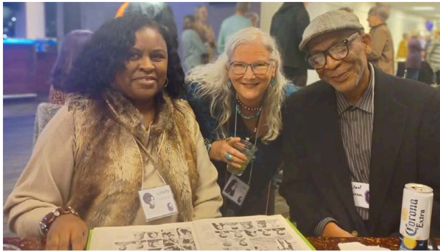
The Class of 1971 at their class reunion in 2022!