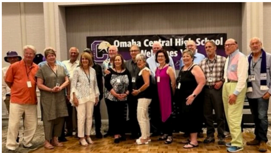
The Class of 1967 at their class reunion in 2022!