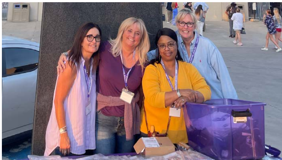
The Class of '82 before an Eagle football game in 2022!