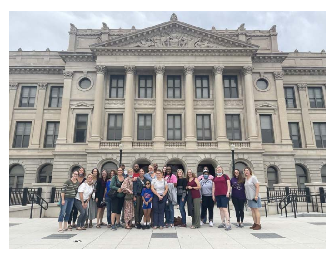
Old friends reunited back at the Nest last year during the Class of 1991's class reunion!