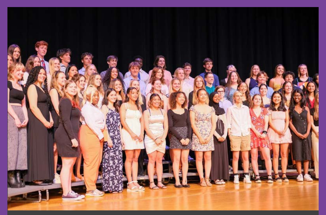
Snapshot of Brilliance: Celebrating the top 10% of our 2023 graduating class at Senior Recognition Night, where their remarkable achievements were honored.