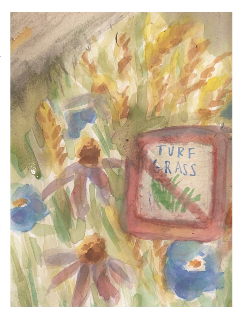
Chlöe Johnson | The Register

We should capitalize on native prairie grass as a distinguishing characteristic. Omaha could be rebranded as a city within a plains state, as a true prairie city. Imagine if boring right of ways—green for less than half the year--become tall wild looking grasses, that bloomed flowers from May until September. Abolish grass and its expensive carbon footprint for the good of Omaha today and generations to come.