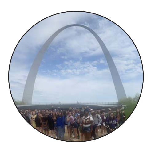
MUSIC TRIP on page 12

In fact the top 100 song's of 2023 include songs from the very early 2000s and before such as Nirvana, Coldplay, Eminem and the Killers. Thus, older artists are coming back to Omaha with new album's and comforting sound, to the delight of young and old and those in between.