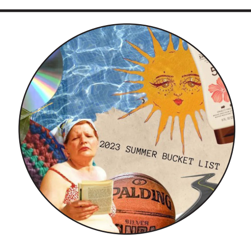
BUCKET LIST on page 14