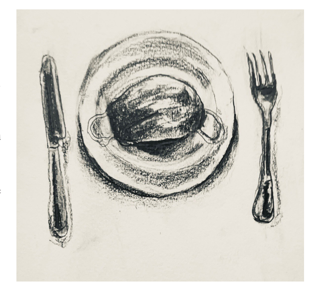
Chlöe Johnson | The Register

While COVID did not cause these eating disorders, it did push over the edge the startling amount of those already at risk. While it is nice to think we are out of the woods post COVID, this will not be true until the dark woods of weight loss obsession are cleared to reveal healthy habits.