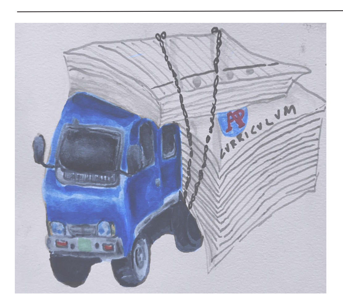
Chlöe Johnson | The Register

Today, Nebraska is still unique among states for its unicameral legislature. Preserving the unicameral means preserving a unique, efficient, and important piece of Nebraska's history, one that reflects the rich history of the state and the ultimate ideal of a government for the people and by the people.