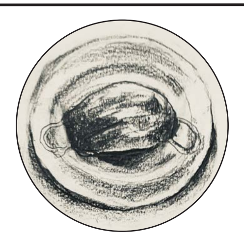
GRASS on page 8