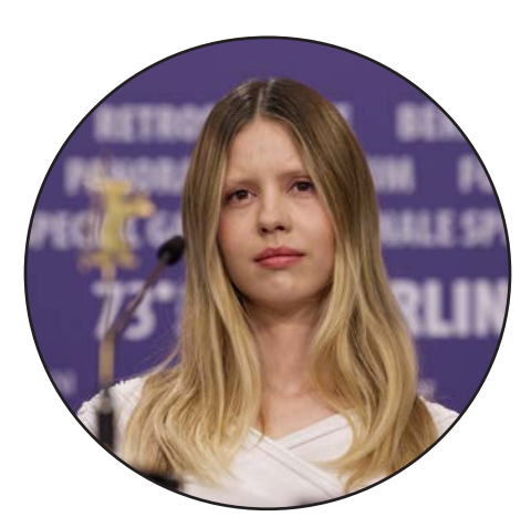
MIA GOTH on page 13