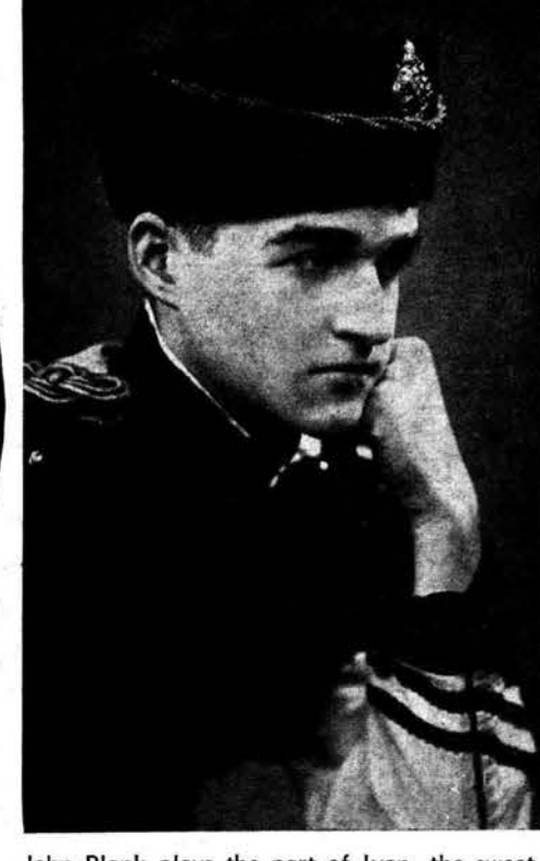
heart of Katinka, who returns just in time to find her marrying another man.