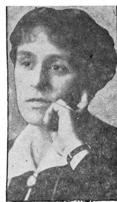
YUNYA MISS MAUDE BOYDEN

"The American schools attempt too much. They try to teach something of everything and in the end the students are apt to know little of anything." Thus, in a few terse words, Maude Royden, England's greatest religious leader, summed up what is to her the greatest defect of the American educational system. "In many respects," she said, "the United States is far ahead of England, but I believe that the English school system is the better of the two."