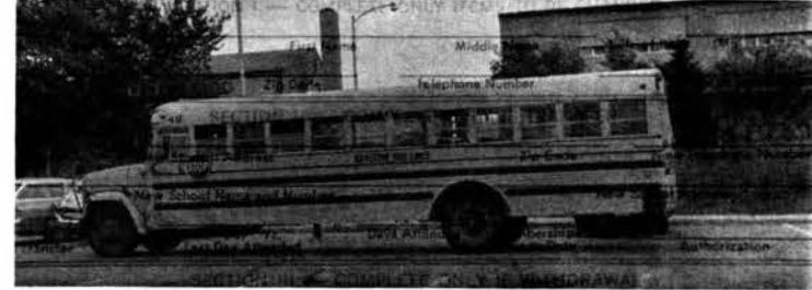
Special transfer form superimposed over bus indicates voluntary integration policy.