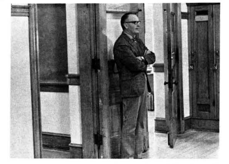
"The policy of requiring teachers to stand at their doors during passing period should be continued?

"Realistic goals" advocated "Number two which called