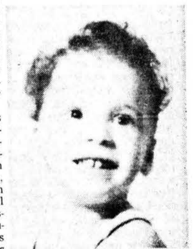
McClellan's did it!