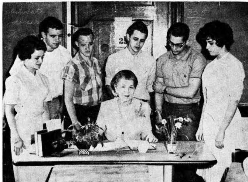
Senior Officers and Sponsor Plan Graduation Festivities

A flurry of graduation activities will begin on Sun., June 3, at 3:30 p.m. with the Baccalaureate ceremony. The seniors from several Omaha high schools will at this time be in cap and gown for the worship service at the Civic auditorium.