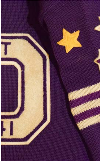
Honoring the Past