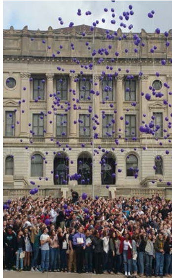
Living in the Present