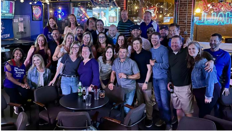
The Class of '92 at their class reunion in 2022!